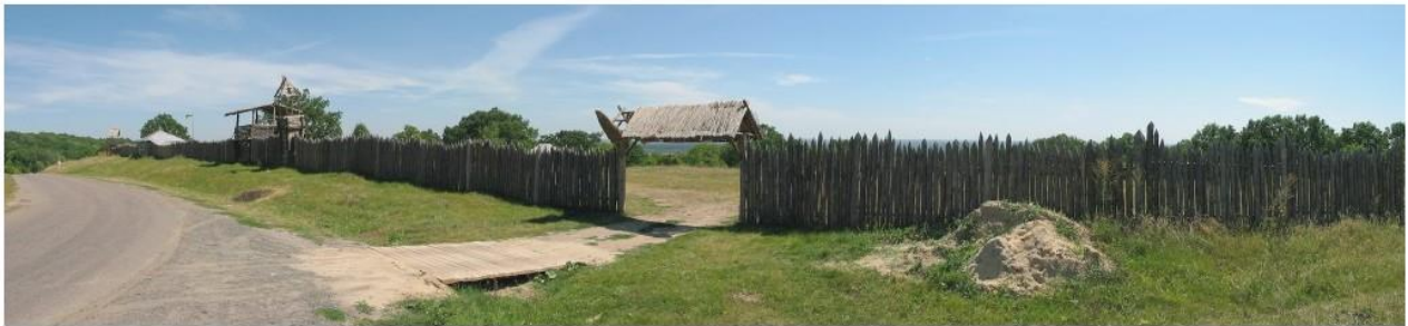
Modern Reconstruction of the Fortified Ramparts Surrounding the Ancient Scythian City of HELON (GELON) as Described by the Greek Historian Herodotus of Halicarnassus, circa 484 - 425 BC.

Gelonus, once a well-fortified enclosure of about 40 square kilometres in size with 3 keeps surrounded by earthen walls up to 16 meters high, is today being reconstructed at Bil’sk in the Poltava Oblast north of the Black Sea where the Helonians once roamed with their kindred Scythians – the Budini.