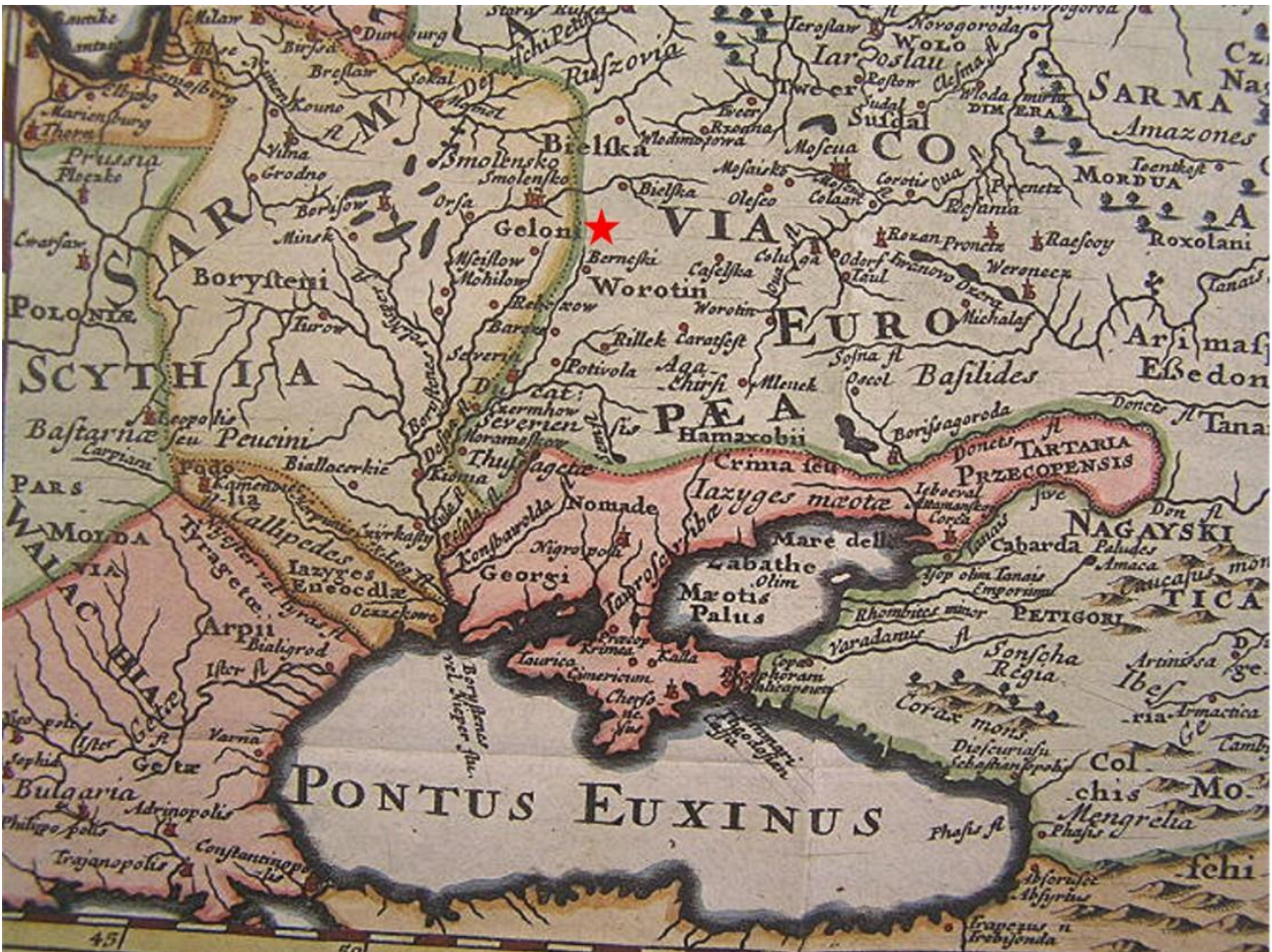
Fragment of Map Entitled: Sarmatia et Scythia, Rufsia et Tartaria Europaea [Sarmatia and Scythia, Russia and Tartar Europe] ~ London 1711 ~

In archaeogenetics, information on the DNA of different ethnic groups from around the world is used to analyse prehistoric events and corroborate accounts from historical sources. The DNA data are reconciled with the findings of archaeologists, linguists, and paleoanthropologists to shed light on the past.